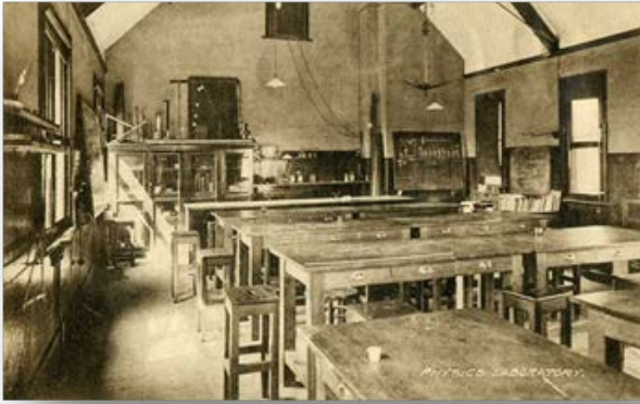
MGS's state-of-the-art physics laboratory c1871