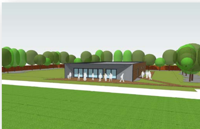
Architect's impression and proposed floor plan (below) of the new pavilion

It will also give visitors and spectators a place to gather for a cup of tea and shelter from the rain whilst watching the match!